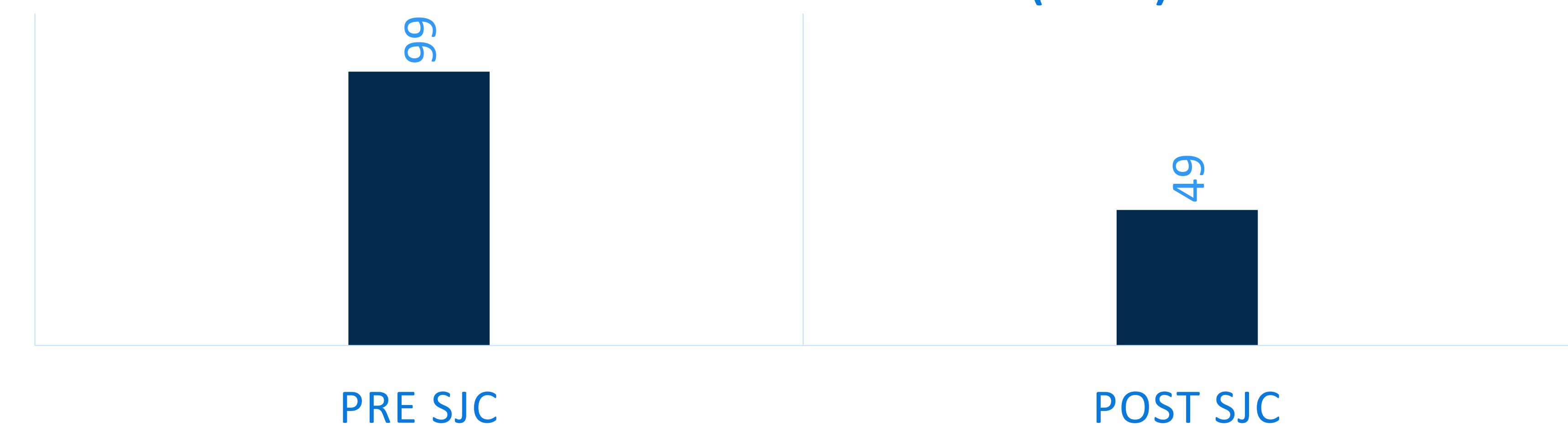
PROBATION VIOLATION PROBATION (% OF TOTAL POPULATION)