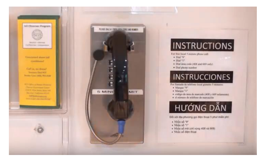
No Cost Release video screenshot, featuring instructions in English, Spanish, and Vietnamese.

Other materials, such as the poster and brochures, were placed in jail lobbies, dorms, and other agency offices. The poster included a QR code that family members with a smart phone could use to directly access information about no cost release options. While these materials were being posted, the jail stopped posting colorful advertisements for bail bonds companies and replaced them with plain text contact information for these companies. The project team has also been working on getting the materials into more community organizations' offices.