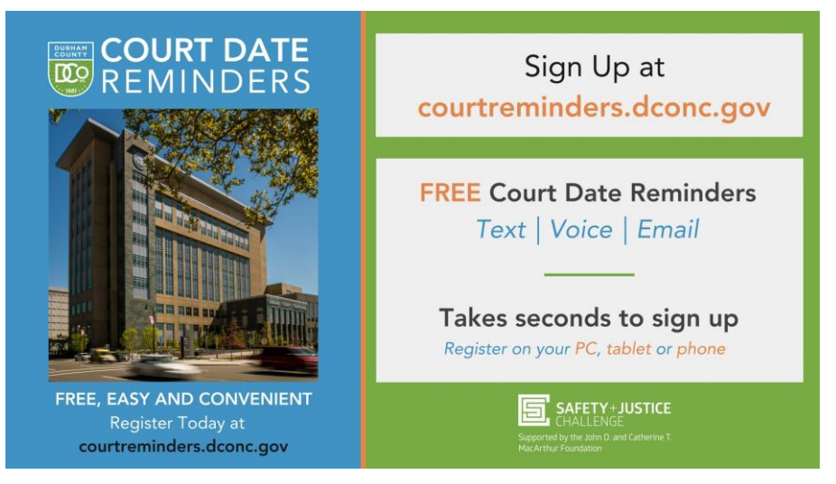
Court date reminder poster.

Implementation of the automated reminder system, which launched in June 2017, was a joint effort between CJRC and the county's information services and technology (IS&T) department. CJRC was responsible for overall execution, and the IS&T department provided significant technical expertise to design and launch the website. The effort received broad support from county and criminal justice leaders, including the Clerk of Courts, Public Defender's Office, District Attorney's Office, and Chief District Judge. All these partners participated in the advertising and outreach efforts.