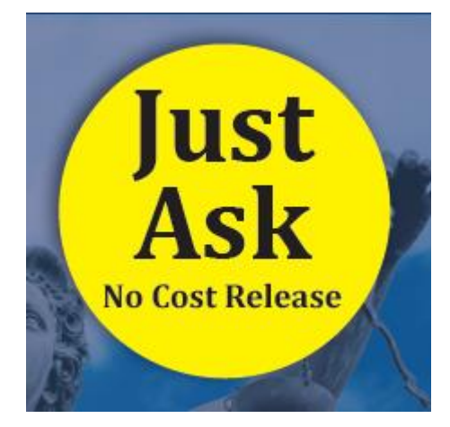
No Cost Release Campaign logo.

Most bail releases involve detainees or their families working with a bonding company that provides the full bond amount up front in exchange for a percentage of that amount, which the company keeps as long as the person appears in court, regardless of the case outcome. Paying a nonrefundable portion of a bond (generally 10 percent) is burdensome for a predominately low-income jail population (Rabuy and Kopf 2017). This burden falls disproportionately on African American and Latinx people, who are more likely to be detained pretrial and are assigned higher bail amounts (Demuth 2006).